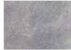
EZ-Accent Water Based Acrylic Stain Charcoal