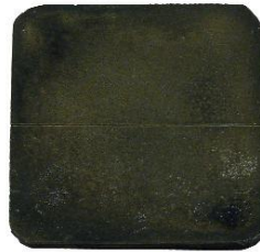
Antique Gray CW-120