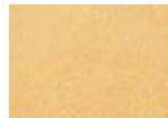
EZ-Accent Water Based Acrylic Stain Spanish Buff