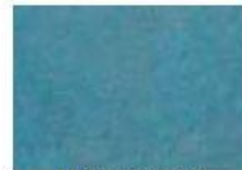
EZ-Accent Water Based Acrylic Stain Slate