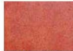
EZ-Accent Water Based Acrylic Stain Sedona