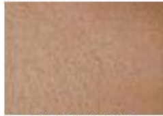
EZ-Accent Water Based Acrylic Stain Pinto