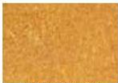
EZ-Accent Water Based Acrylic Stain Cimmarron