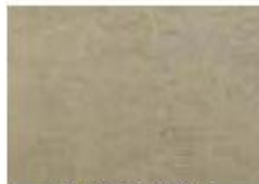
EZ-Accent Water Based Acrylic Stain Sandalwood