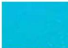
EZ-Accent Water Based Acrylic Stain Turquoise