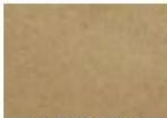
EZ-Accent Water Based Acrylic Stain Buckskin