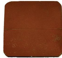
Terra Cotta CW-230