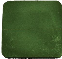
Moss Green CW-170