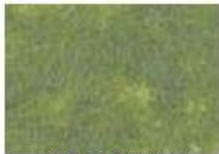
EZ-Accent Water Based Acrylic Stain Juniper