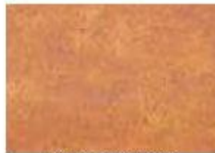
EZ-Accent Water Based Acrylic Stain Sandstone