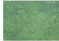
EZ-Accent Water Based Acrylic Stain Fairway