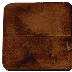
Bark Brown CW-280