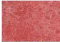
EZ-Accent Water Based Acrylic Stain Colorado