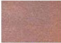
EZ-Accent Water Based Acrylic Stain Mission Brown

Pro Line stains are water based and used for a more transparent finish on the concrete. They provide a finish that is not as bright as the Smiths which some customers may find valuable.