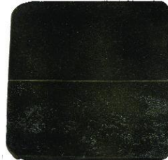
Olive Green CW-180