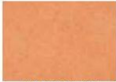
EZ-Accent Water Based Acrylic Stain Rust